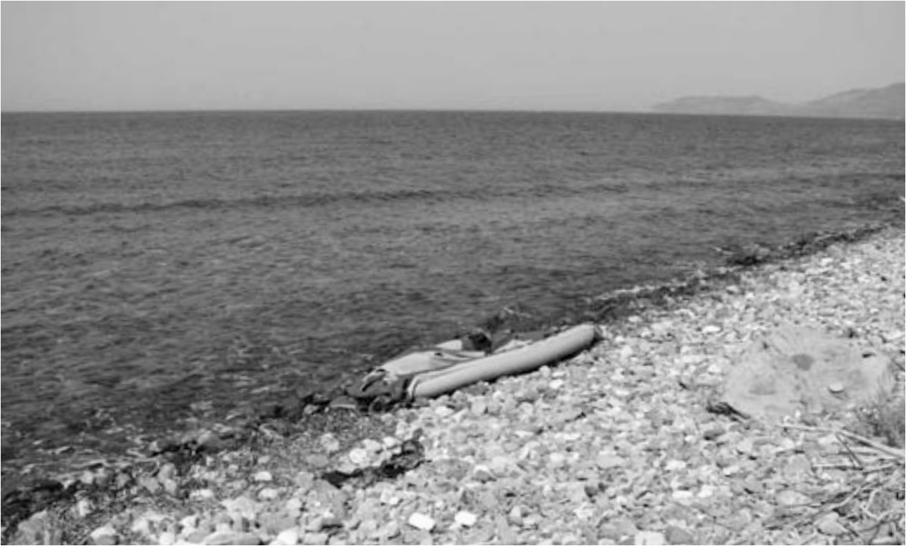
Northcoast of Lesbos: marooned rubber dinghy.