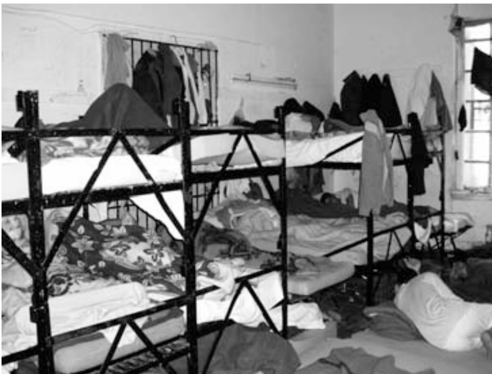
Samos: bedroom in the detention centre

We spoke to a Palestinian from Lebanon who had a broken rib as a result of mistreatment by the coast guard. At the time of our visit no examination in a hospital had been arranged, despite the fact that the affected person had been complaining about the pain and blood in his spittle for weeks. Only during the second day of the visit, could the delegation secure that the mistreated individual could be brought to hospital and treated – over two months after the injury was inflicted 34 . Refugees from Ethiopia and Algeria also report severe mistreatment during apprehension by the coast guard.