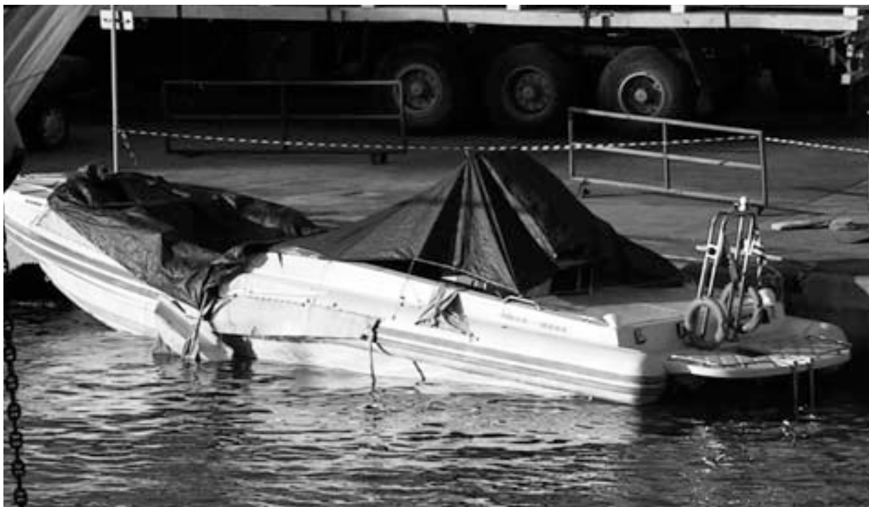
Chios: A boat mistakenly shot at by the coast guard, just near the coast.

Special units 12 , which do not operate under the usual civilian regional chains of command as the rest of the coast guard, are operational in the name of the coast guard. These units operate independently on self-assigned, often secret, missions. They take orders directly from the leadership of the coast guard's military section.