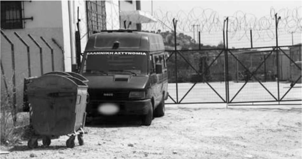
Lesbos: entrance to the detention centre