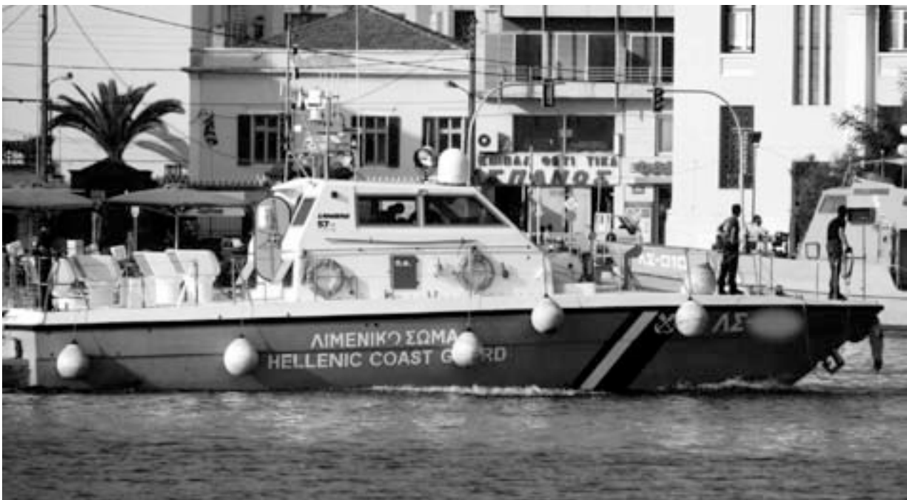
Boat of the Lesbos coast guard showing mount for a machinegun on its prow.

Even the head of the coast guard Mikromastoras confirms that, secretly, refugees are brought back to the Turkish coast, even after they have been on Greek