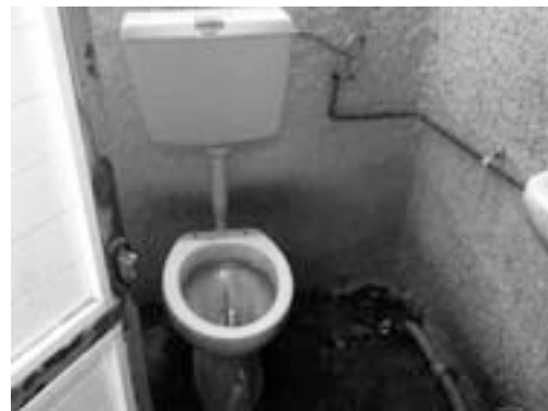
Detention centre Lesbos: At the time of our visit one functioning toilet was provided for 50 detainees.

Our delegation informed the children of their rights in Europe and in Greece, and referred them to an organisation which works for children's rights and the reception of asylum seeking children. Through