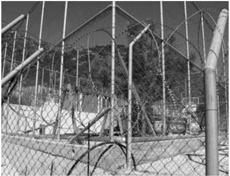
Samos: children's playground in the new detention centre