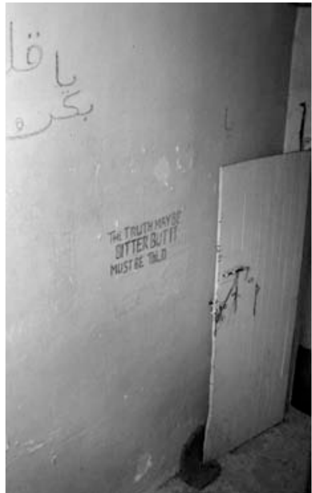
Wall inscription in the former detention centre on Lesbos

For these reasons, the construction of an asylum system in Greece and the European Union is essential. This system must be based on the principle of the absolute respect for human rights and asylum law, as proclaimed by the heads of state in Tampere in October 1999. If this is not the case, then Europe is jeopardising its achievements in human rights development – of which it is rightly proud – at its very own borders.