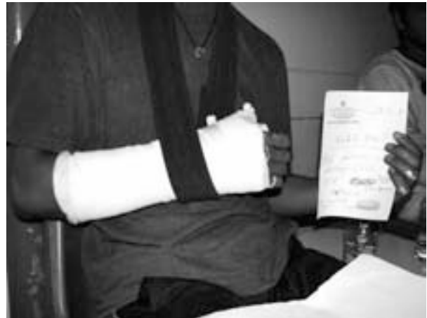
Patras: Afghan minor in hospital after severe ill-treatment