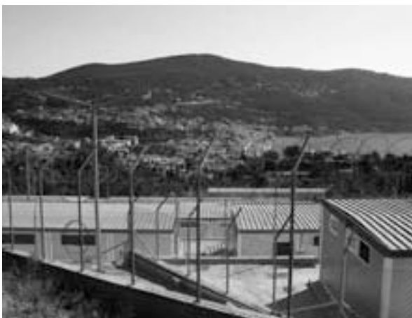
Samos: new detention centre

The detention centre on Samos is to be closed imminently. The new centre in Vathy has been under construction for years, but should be open shortly. The available places for detainees on Samos will quadruple as a result, to around 400 places. The new centre should be an improvement on the current one: there is to be an open area for use by detainees, separate areas for women and children and a functioning sanitary system. The delegation of the European Parliament still has its doubts however: »The flat-roofed ›cabin‹ design of the structures might raise question marks about their suitability given the local climate«. 35 In any case, no improved conditions will disguise the fact that it is a detention centre for people who have committed no criminal offence, and who need protection.