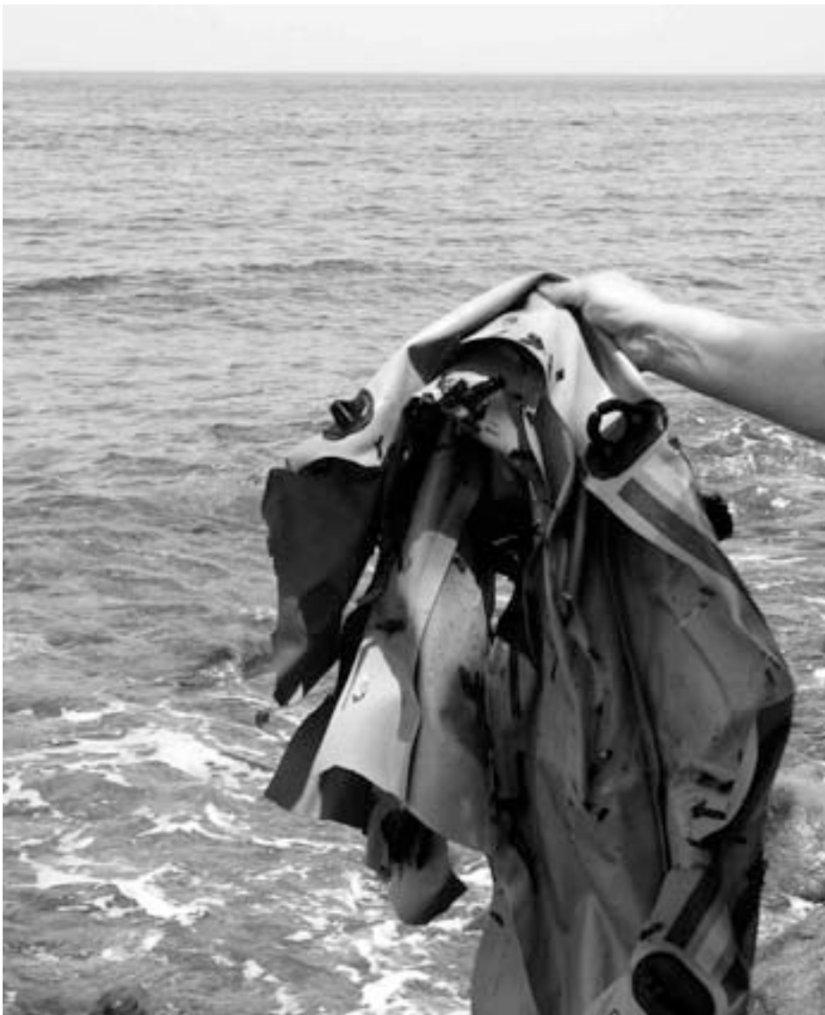
Lesbos: We find a shredded rubber dinghy. What happened, and the fate of the passengers, is an unanswered question.