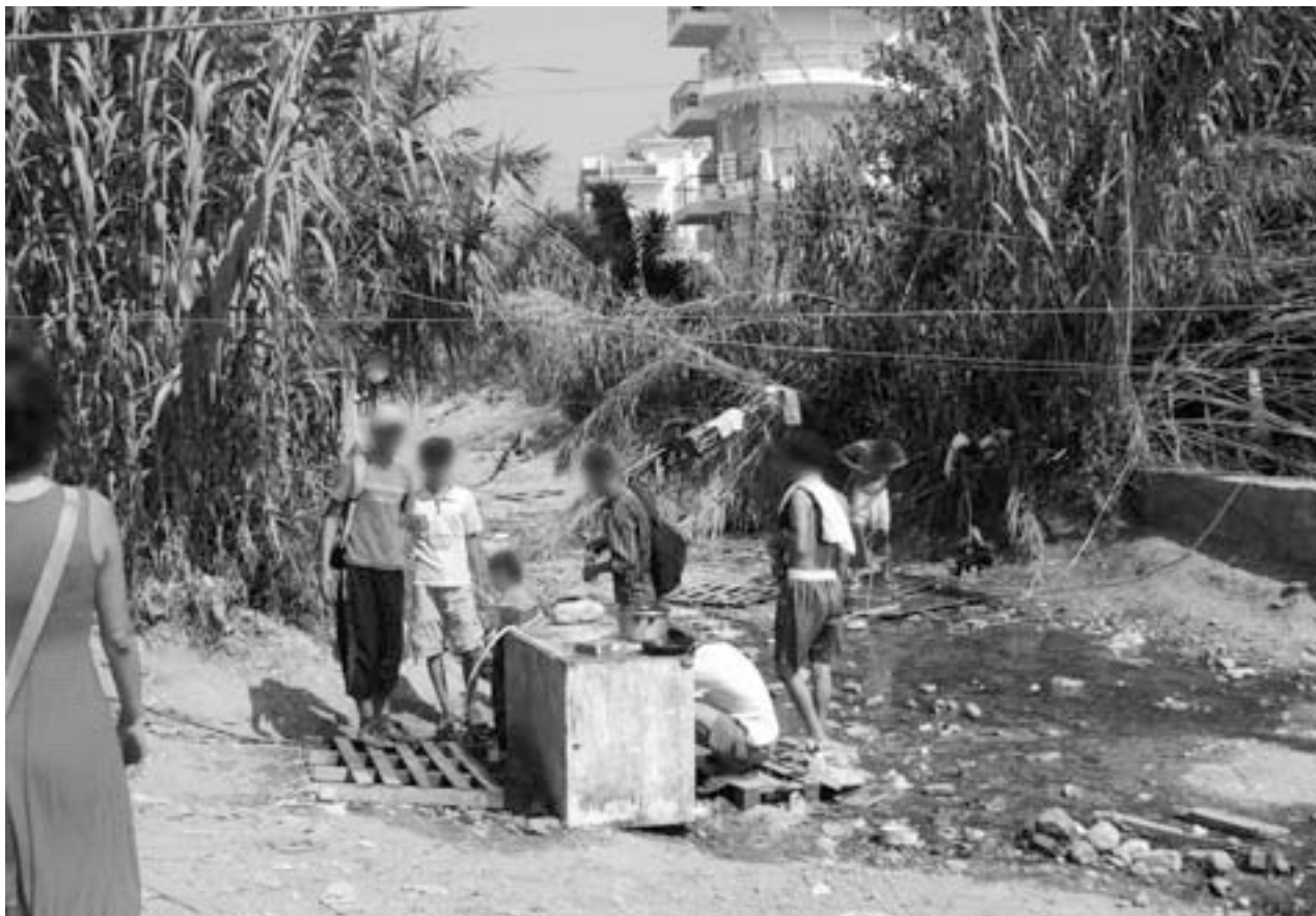
Patras: unsheltered refugees at a river, which serves as the only water supply

The people from the camp were trying to get into the off-limits port area. They wanted to reach Italy on one of the ferries. Sometimes they tried to get on board by clinging to lorries. Again, we heard of abuse by the Greek