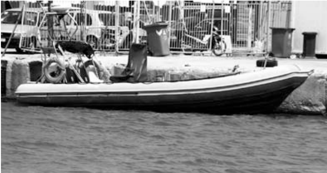
Special boat belonging to the coast guard, without identifying markings or flag.

On 5 August 2007 an incident drew attention to the indiscriminate use of violence by the coast guard, hitting headlines across the country. In the night of 4-5 August 2007, in the strait between Chios and the Turkish coast, a coast guard patrol boat came across a grey dinghy with an outboard motor. The officials later claimed they had repeatedly called on the three men on the suspect dinghy to stop; however the dinghy drove off at full speed and tried to evade capture. In response the patrol boat took up pursuit and opened fire on the dinghy from behind. One of the men on board died from the gunshot wounds.