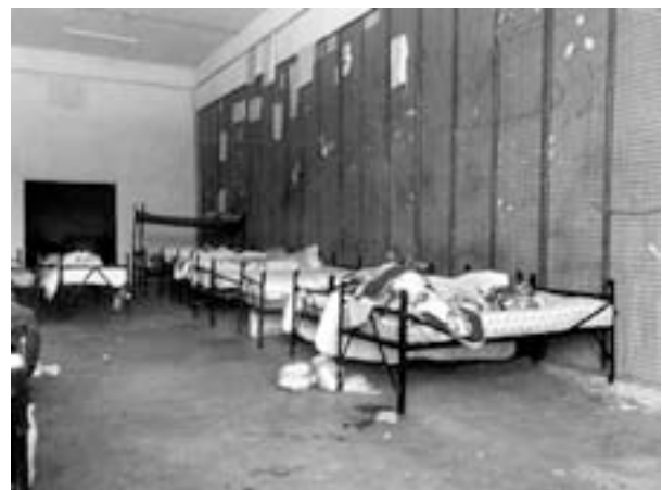
Lesbos: bedroom in the detention centre