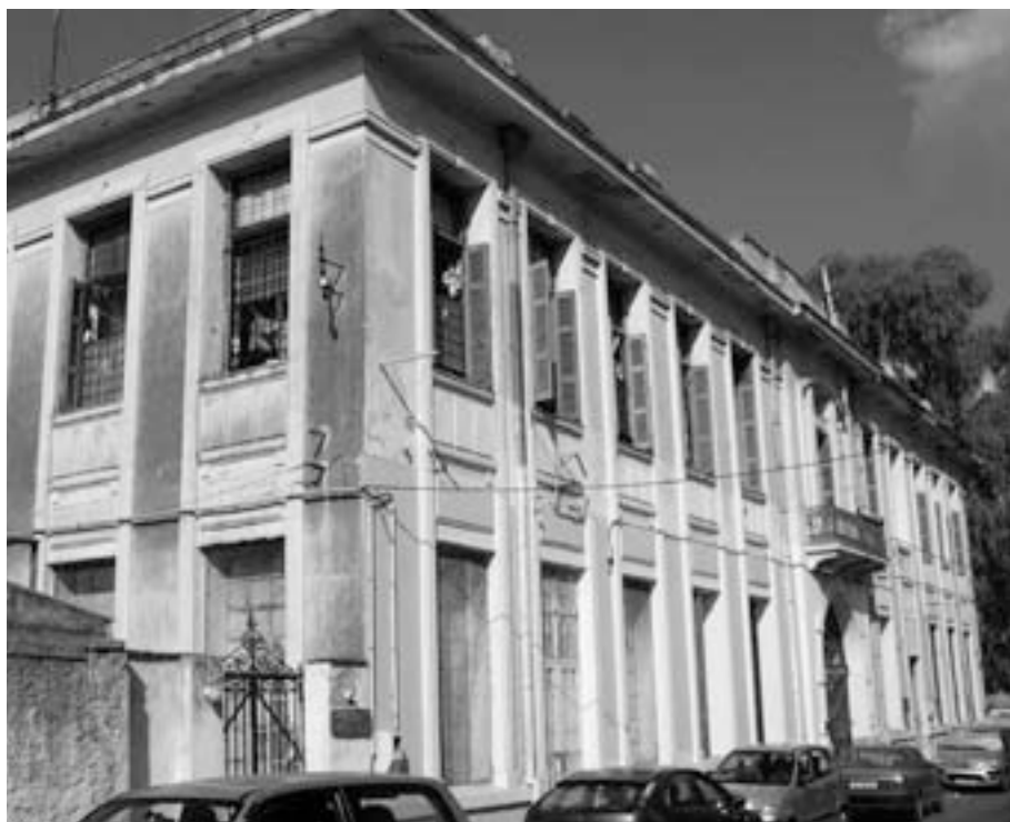
Detention centre Samos-City

The detention centre is in Samos City, in a former cigarette factory built in 1928. The building, which is in serious need of repairs, if not totally dilapidated, is in the middle of town.